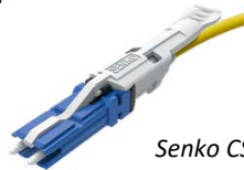
Senko CS for QSFP-DD (3.8mm pitch)