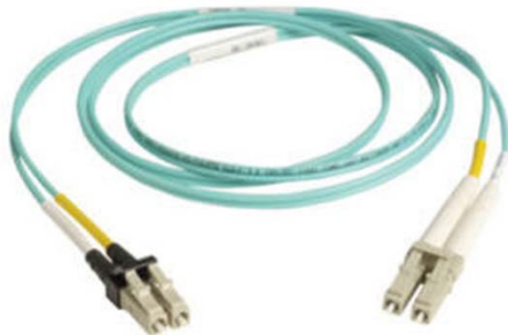
Mini LC Duplex (5.25mm pitch)